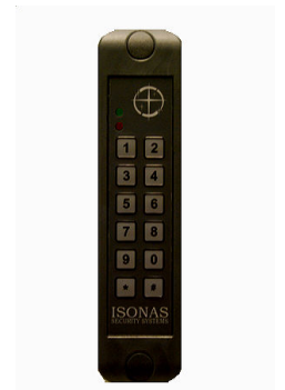
The ISONAS PowerNet Reader-controller with optional Keypad

Now the Crystal Matrix Software™ which comes bundled with your ISONAS IP Readers is available with the Advanced Security Option (ASO), designed to relieve Property Managers of the administrative and clerical burden of frequent updates to the database. Tenants can do it themselves!